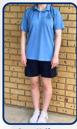
Sport Uniform (Jacket & pants available for Term 1 & 4)