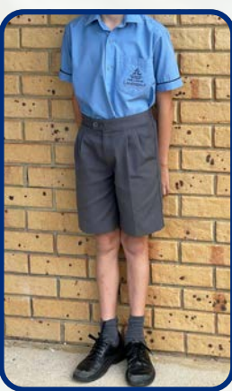
Summer Uniform Term 1 & 4 Male