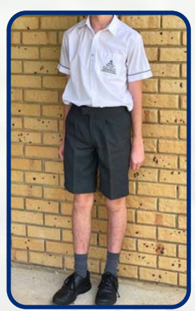
Summer Uniform Term 1 & 4 Male