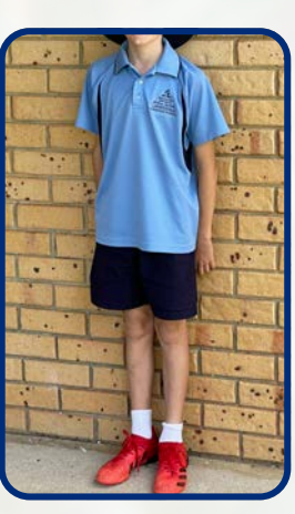
Sport Uniform (Jacket & pants available for Term 1 & 4)