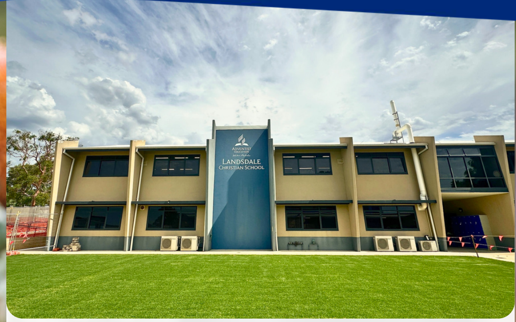
New High School multipurpose space between B & C Block.