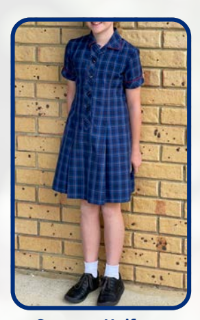
Summer Uniform Term 1 & 4 Female